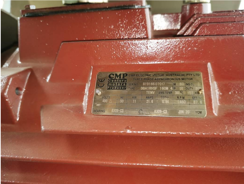
Photo of nameplate before test