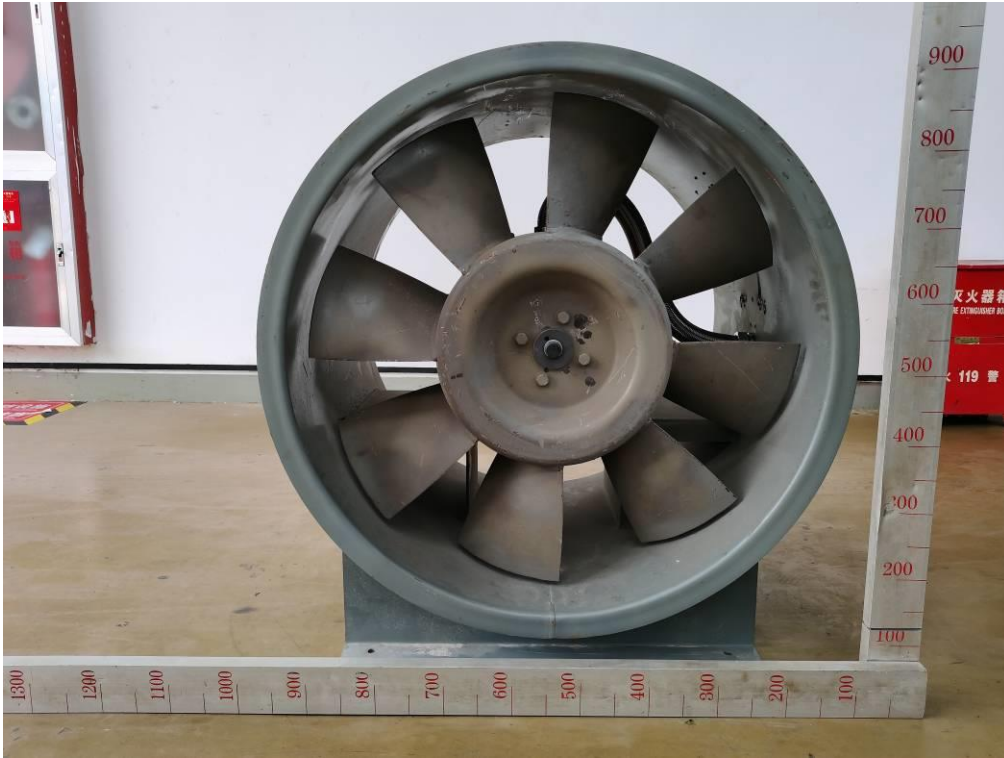
Photo of fan before test