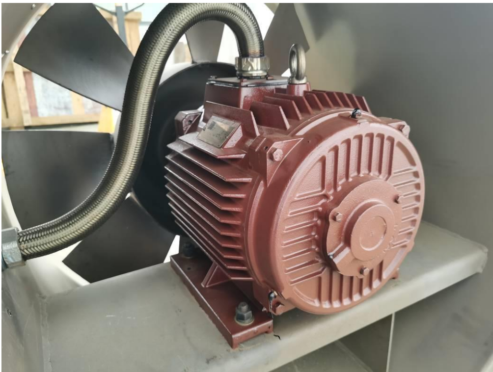
Photo of motor after test