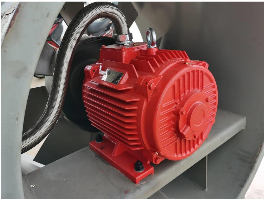
Photo of motor before test