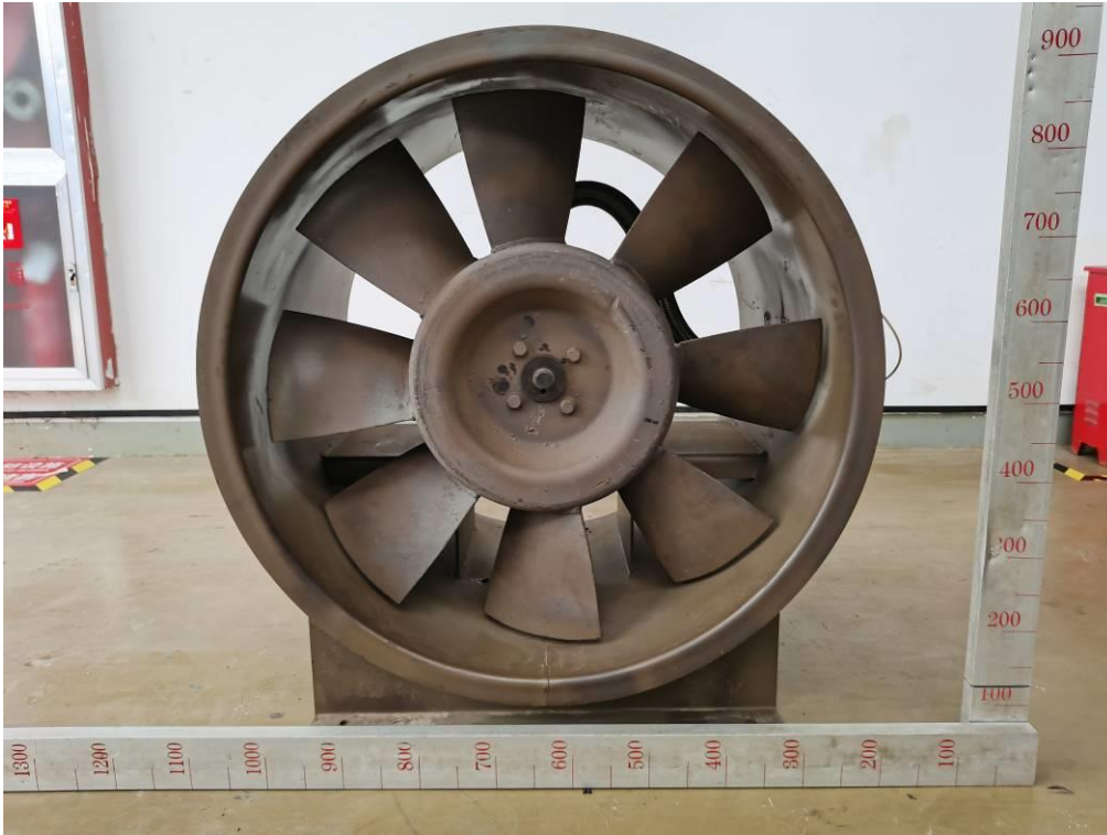
Photo of fan after test